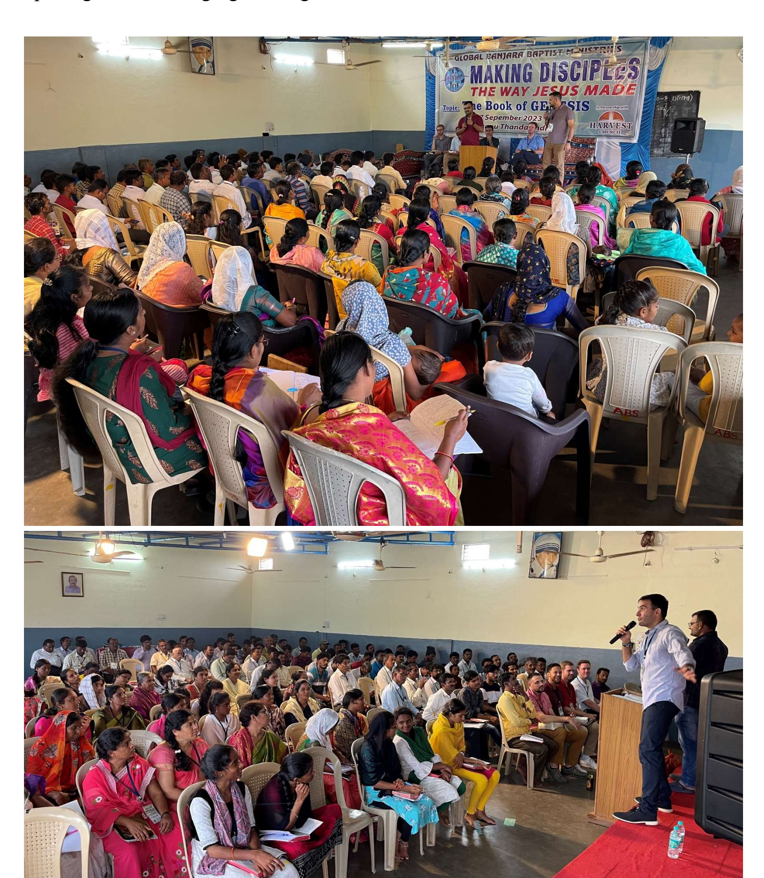
GBBM thanks Harvest for sending a team; and welcomes more churches to visit India, visit ABS, meet the Banjara people, and provide training and encouragement for leaders.

opening and encouraging training sessions.